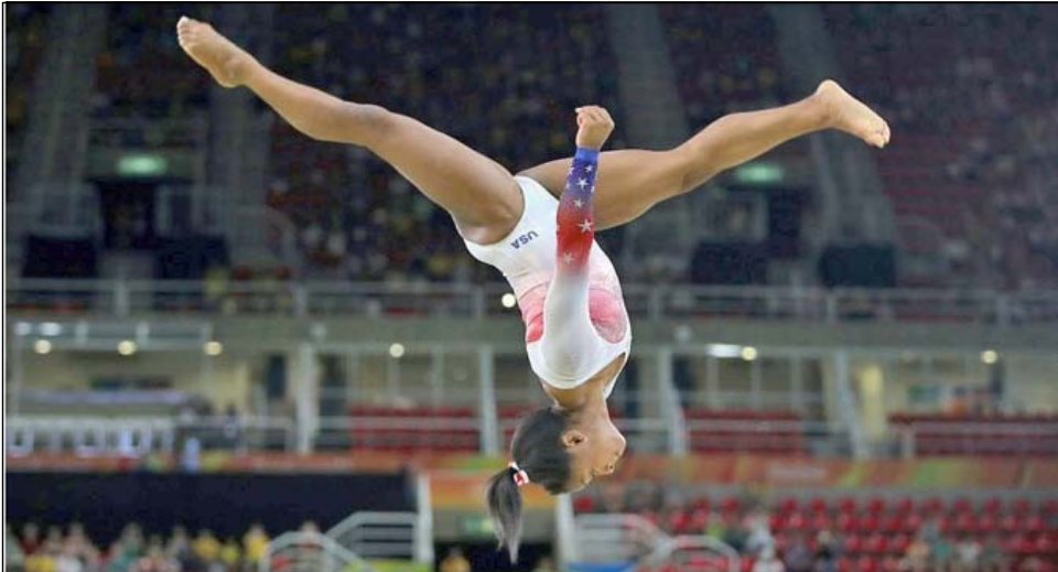
Simone Biles of USA at the Rio Olympics.

"Missing Fiji already! Some of the nicest and most hospitable people I've ever met in my life! This was a part of our farewell. Totally unexpected"